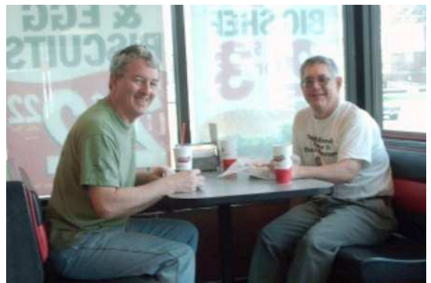
PD & BS