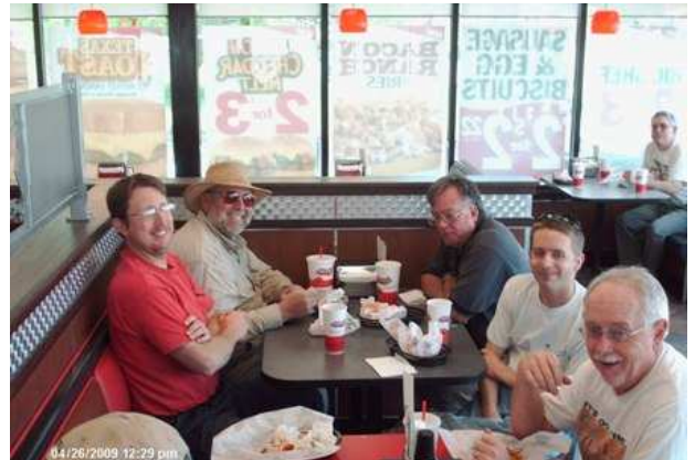
Relaxing at lunch