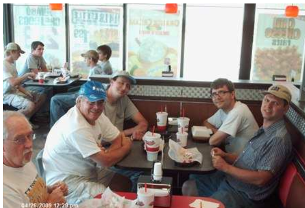
More smiling faces...and aching muscles