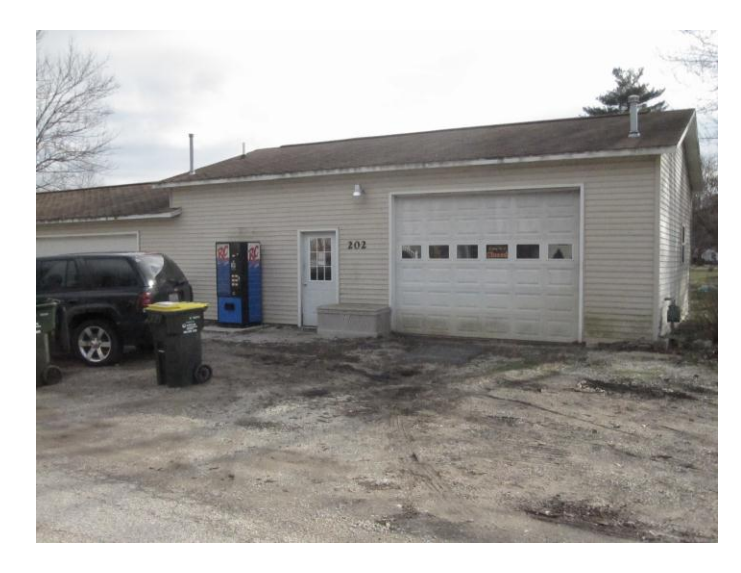
The inside needs a little work.