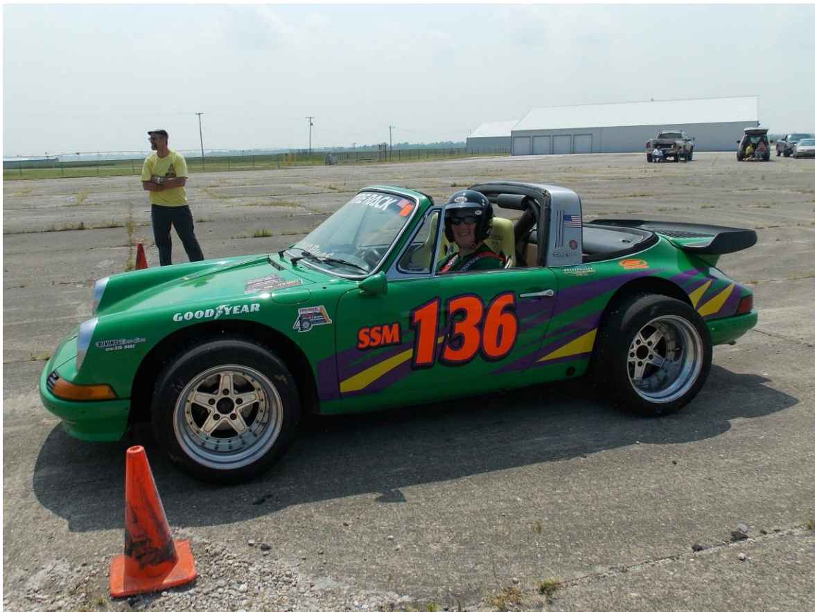
Paul Dornburg in Big Green