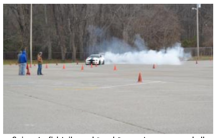
Spinouts, fishtails, and "push" monsters appeared all over since the course-du-jour was a cold, slippery asphalt surface that contained enough straightaways to build some decent speed, but with some pretty tight turns to fit into the Roberts Park lot.