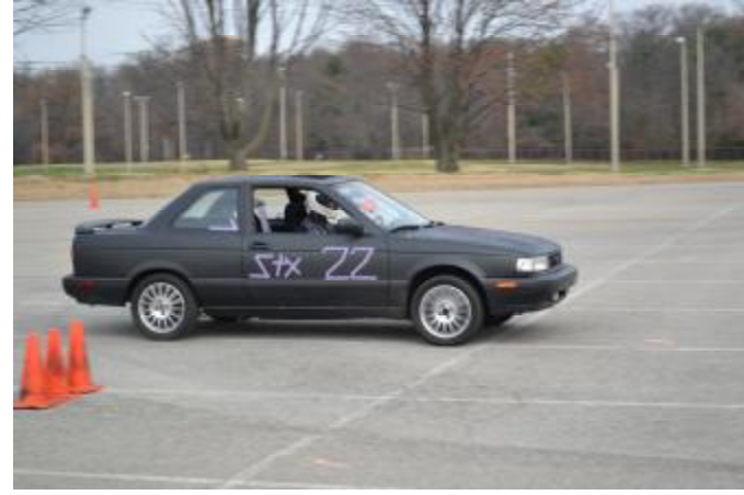
Cool? No. Example of sports-car craftsmanship? No. Fast? $%^& YEAH!

The Sleeper of the Weekend Award went to this Nissan Sentra which was one of the faster cars at this year's "No Stinking Chicanes II" Fun Autocross at Roberts Park.