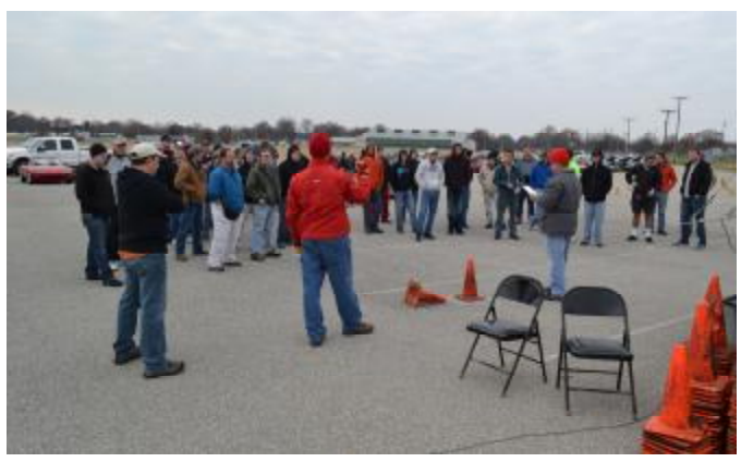
Our largest driver's meeting of the year. As always, plan your fires accordingly, and "Don't get hurt!"