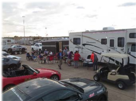
Lunch in our paddock area, one of the few times it wasn't raining.