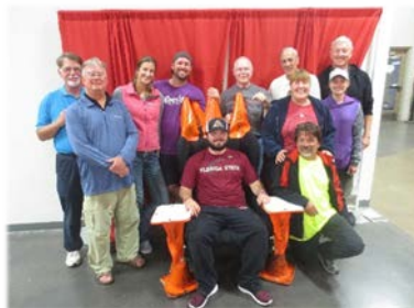
The 2018 Nationals crew at the Friday night banquet.