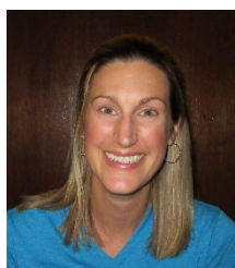
New Board Members