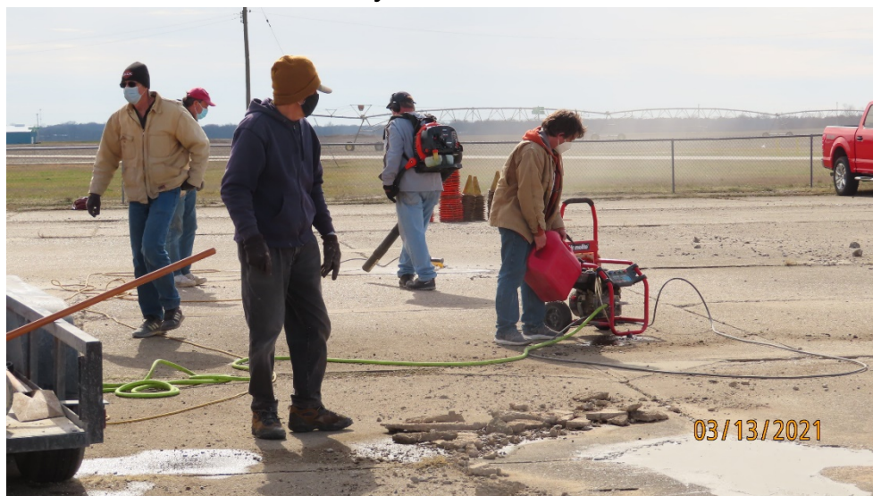
The crew at work on day 2.

Only Southern Indiana Region member's points are displayed.