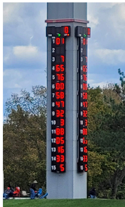
Car #47 finishes in 8th in Sunday's feature race. Spectators and their lawn chairs were a welcome scene.