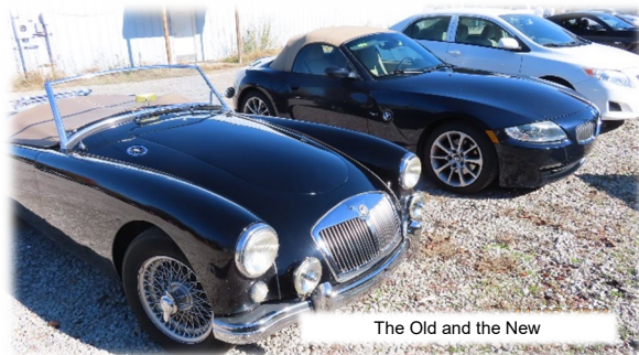
The Old and the New